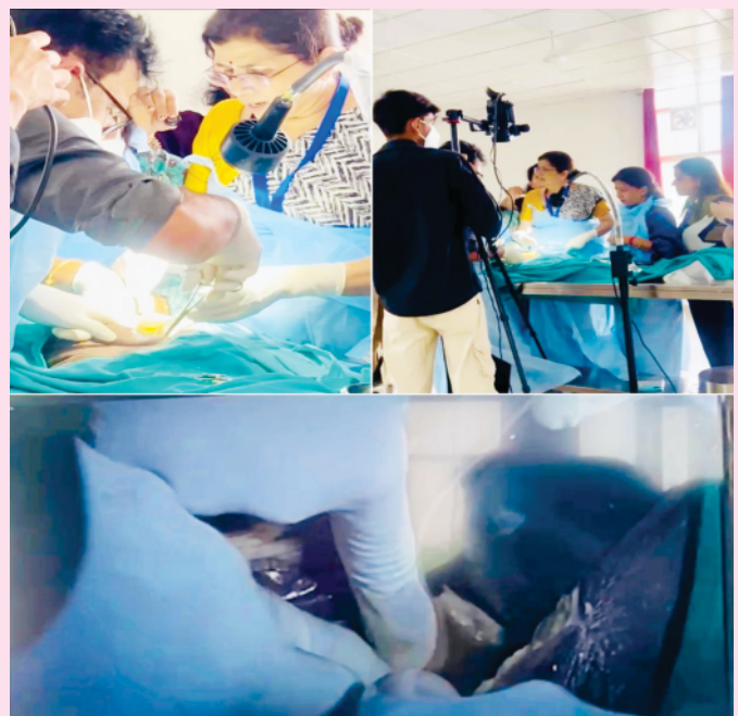
Pioneering Cadaveric Dissection Workshop Led by Eminent Gynaecological Experts in Action.

pregnancy to infertility treatments and vaccination strategies tailored for women and adolescents.