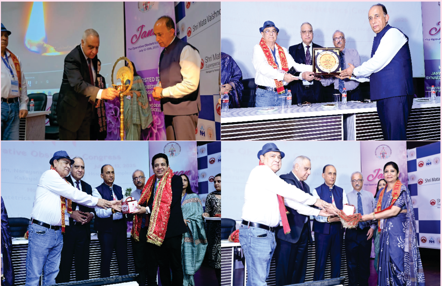
Glimpses from JANAN-2025 hosted at SMVDIME.

A major highlight was the region's first-ever cadaveric workshop, offering participants an invaluable hands-on experience to refine anatomical knowledge and surgical skills under expert mentorship. The rich scientific programme included live demonstrations of critical obstetric interventions, advanced suturing workshops, and insightful lectures on high-risk pregnancies, thromboprophylaxis, infertility management, and vaccination strategies for women and adolescents.