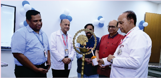
Doctor's Day 2025 celebrations at SMVDIME in full spirit with the Executive Director, faculty, and dignitaries coming together.

The celebration concluded on a joyful note with a cake-cutting ceremony, symbolizing unity, gratitude, and pride within the medical fraternity. A heartfelt vote of thanks acknow-