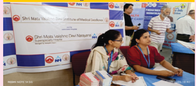
Multi-Speciality Health Camp was held at Shri Mata Vaishno Devi University