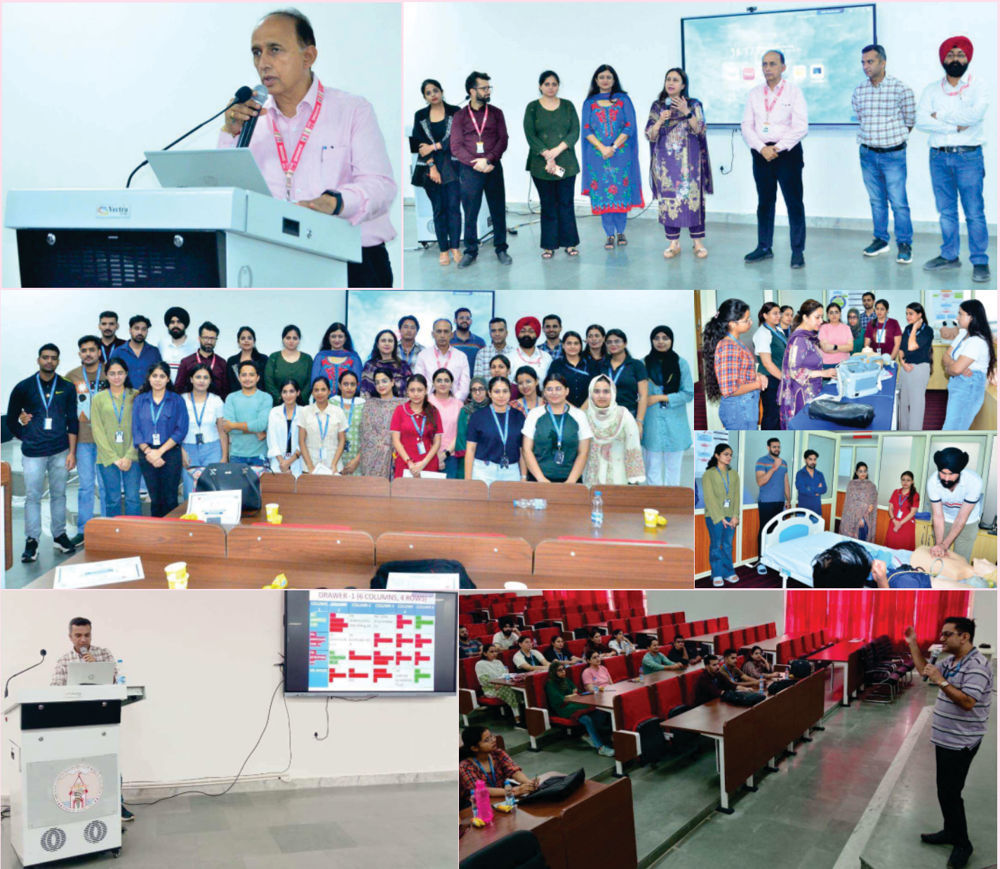
Enhancing Lifesaving Skills: BLS Workshop in progress at SMVDIME.

officers and nursing personnel from Shri Mata Vaishno Devi Narayana Superspeciality Hospital, successfully underwent the training. The workshop served as a significant step towards institutional capacity building for evidence-based resuscitation practices and preparedness in handling medical emergencies.