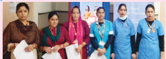
In-house Mega ECG Screening Camp