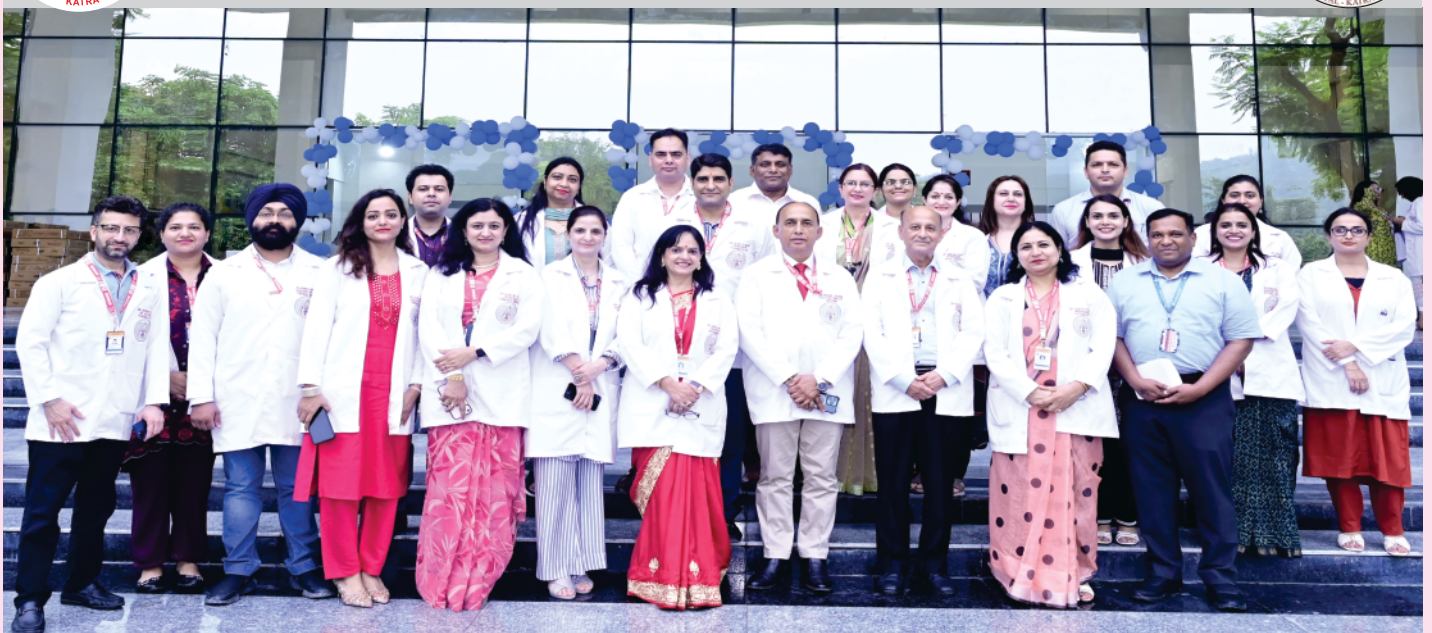
A collective moment of all doctors at SMVDIME captured together on Doctor's Day 2025.