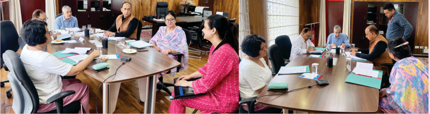
Dedicated Efforts in Action: The Selection Committee at Work.

This strategic addition to the academic team reflects SMVDIME's unwavering commitment to upholding excellence in medical education and fostering a culture of academic distinction.