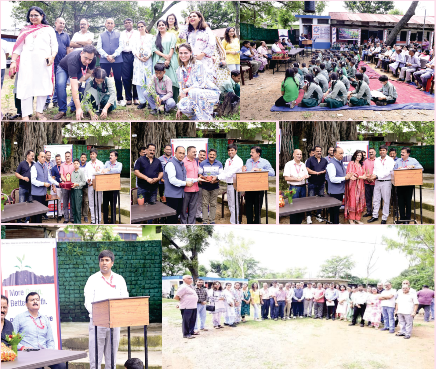
Plantation Drive Highlights under "Ek Ped Maa Ke Naam" at Govt. Girls Middle School, Panthal.